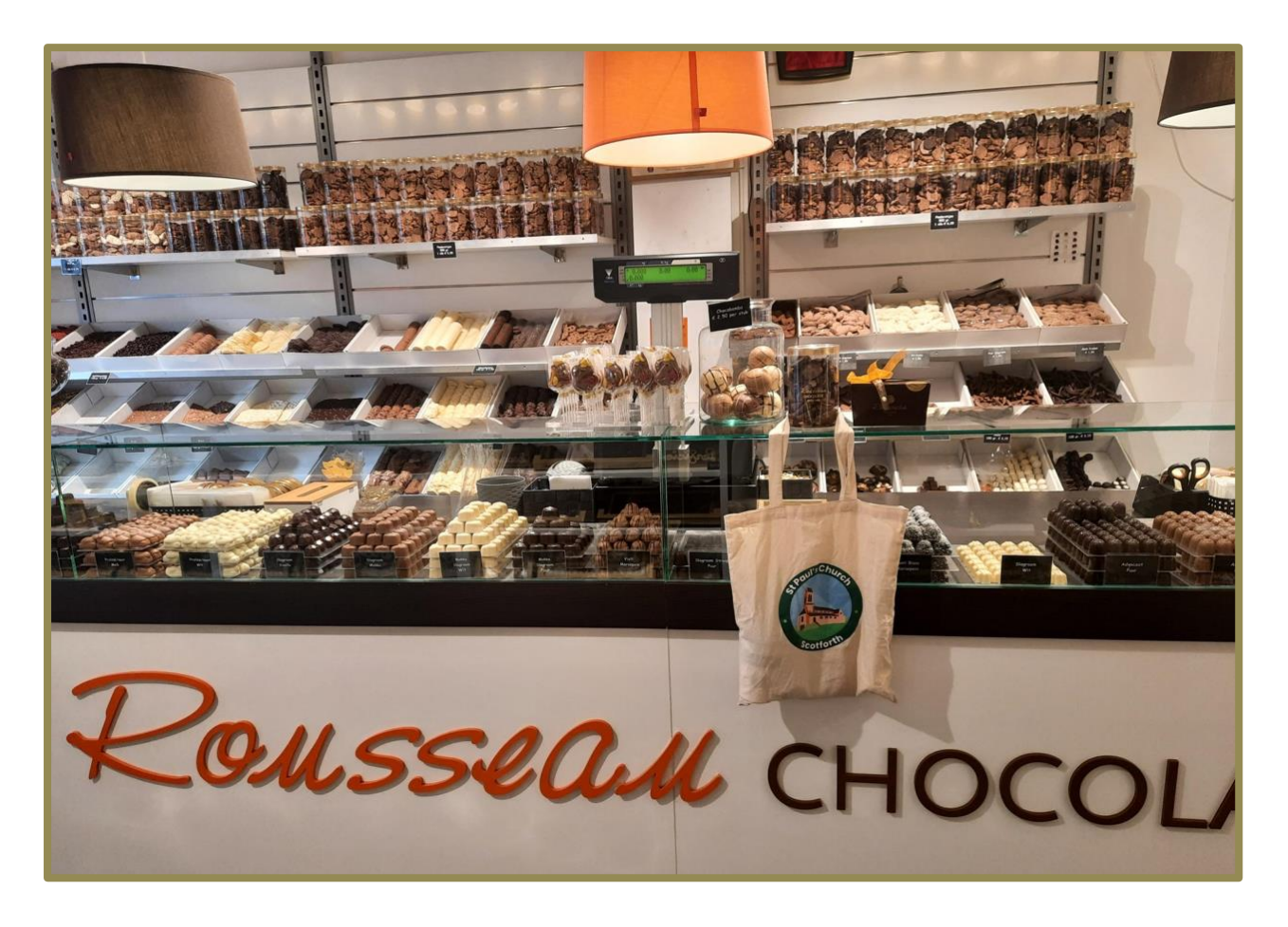
Photo of the tote bag in a chocolatier's shop in Maastricht. The pindarotsjes were delicious!