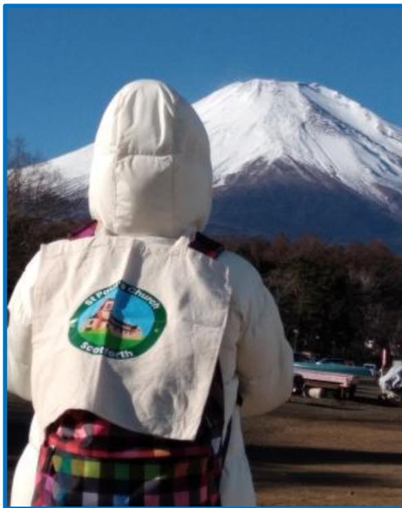
(Mount Fuji and Sakurajima both Volcanos)